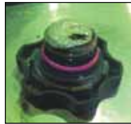
Figure 3: Sludge on breather cap

NOTE: For further information, pictures, and part numbers, reference Cummins® TSB 140017. This technical service bulletin can be located on QuickServe Online in the "TSB" tab under the "Service" section.