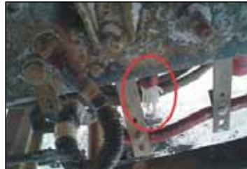
Figure 2: Ice in road draft tube