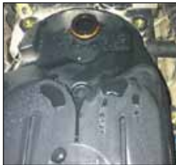
Figure 1: Condensation on outside of breather

This document informs the field of ISB 6.7 engines experiencing a freezing breather filter or ice in the road draft tube in below freezing temperatures. Oil leaks (at the turbocharger seal, valve cover gasket, and rocker housing gasket) and high pressure crankcase codes will most likely be observed.